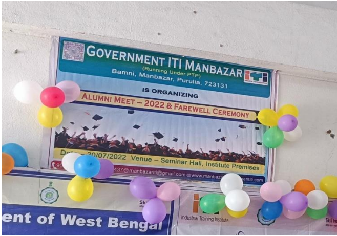
Banner of Alumni Meet Program - 2022