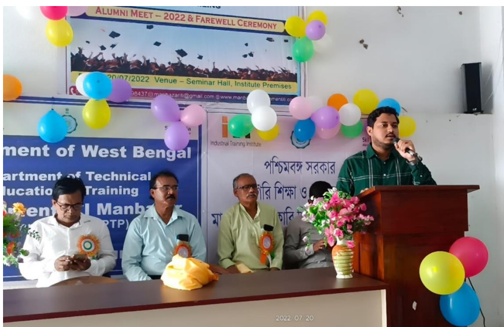
Speech given by Honorable Principal Sir