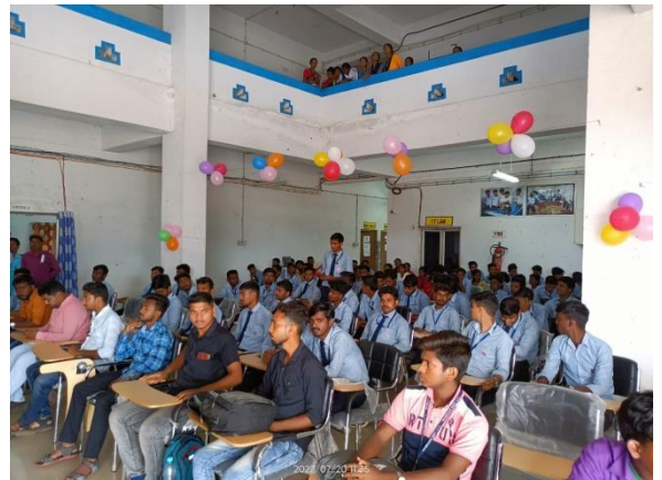
Front view of Audience