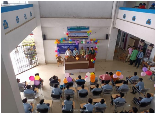
Top view of Program Hall