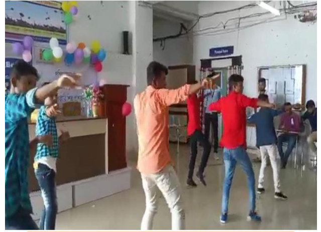
Cultural Performance by our Alumnae's