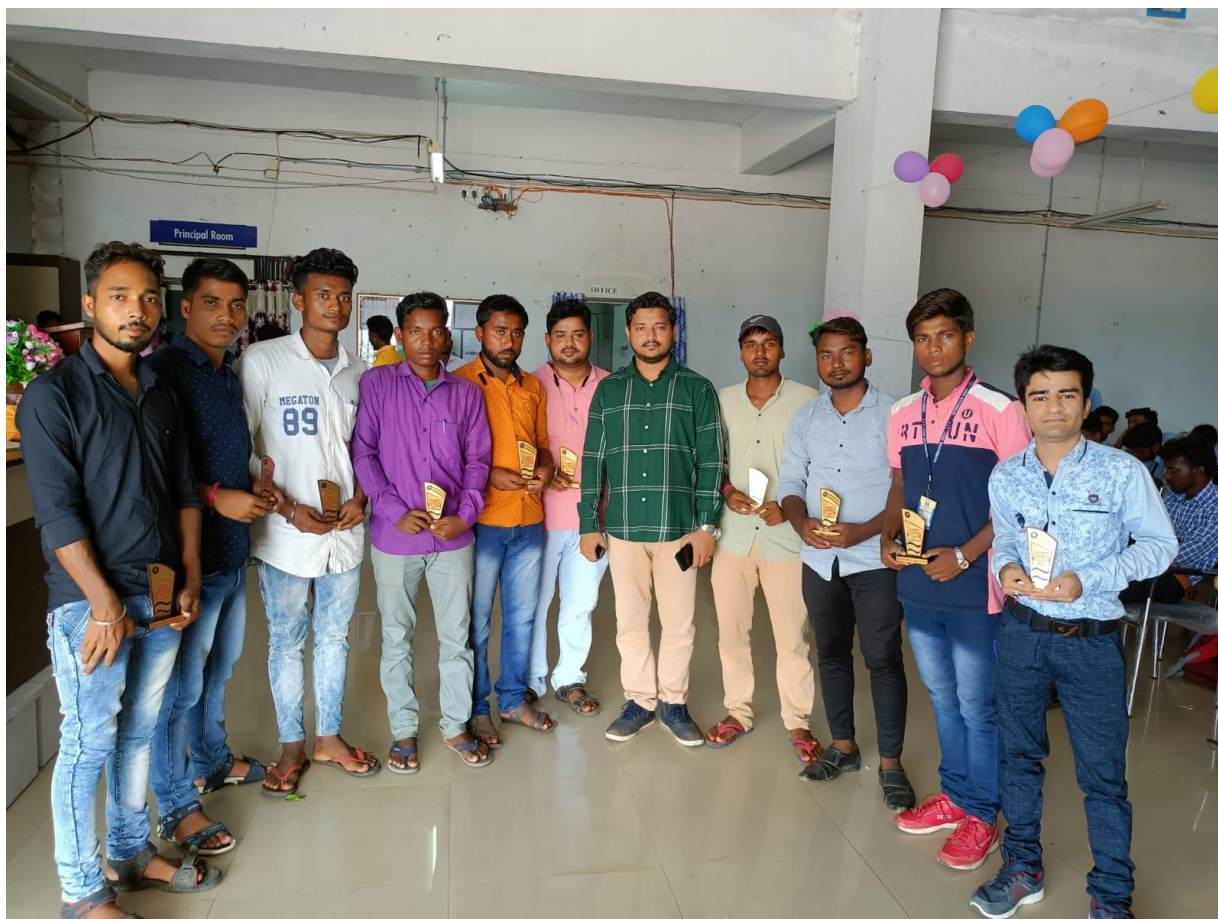
Honorable Principal Sir with new office bearers after 1 st General Meeting