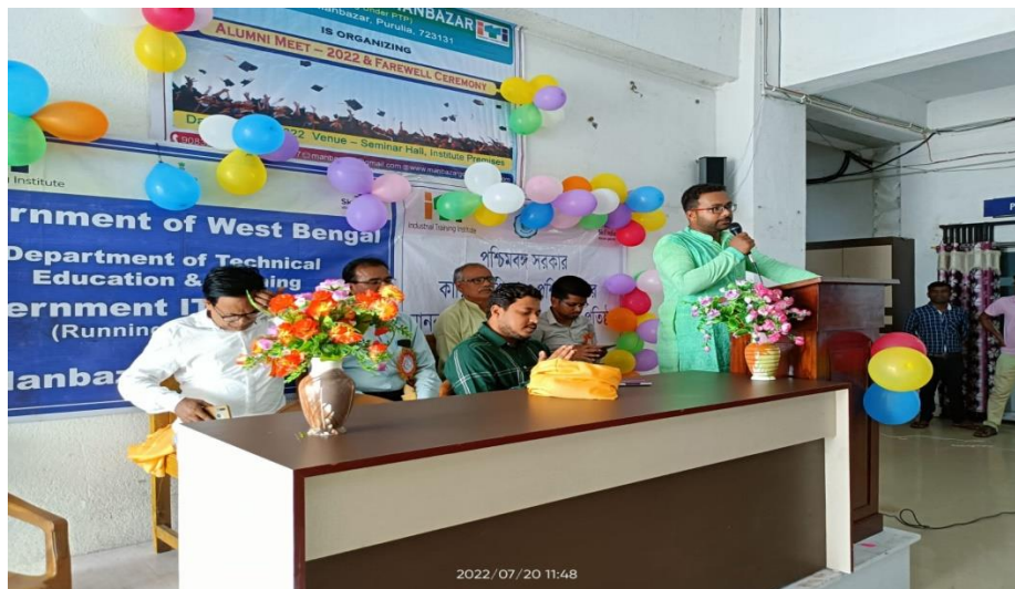
Dignitaries on Alumni Meet Program Dias